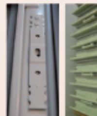
clamps fire rated and multipurpose

To be set open for the fastening with mortar