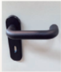
handle and plate fire rated

All doors are always supplied with following accessories included in the prices.