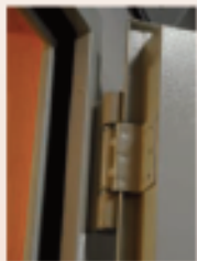
hinges fire rated

CE marked according to standard EN 1935 Hinge with spring (left) and bearing hinge (right)