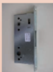
Lock for secondary leaf fire rated

Blocks the secondary leaf in closed position