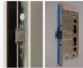
locks fire rated and multipurpose

CE marked according to standard EN 12209, standard lock (left) and antipanic lock (right) for use with antipanic crossbars