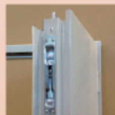
latch in secondary leaf multipurpose