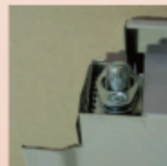
self-blocking in secondary leaf fire rated

Blocks the secondary leaf in closed position