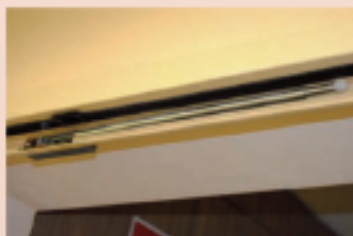
closing regulator fire rated

Additionally with the double leaf doors: