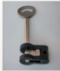
"patent" key with plastic insert fire rated and multipurpose