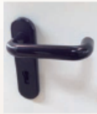
handle and plate multipurpose