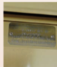
conformity mark fire rated