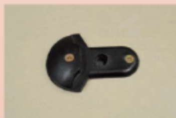
floor socket fire rated and multipurpose