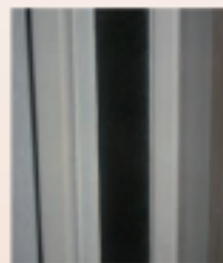
self expanding gasket fire rated