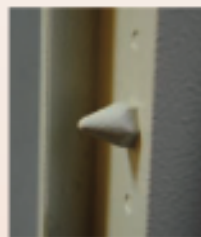
bolts fire rated